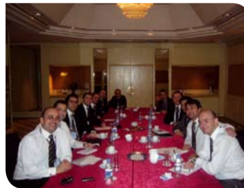
Figure 2: Meeting of the regional correspondents of Turkiye ESRU in Ankara, 2009

Moreover, the active participation of our members in the scientific sessions, case discussions, nightmare sessions and debates turned these meetings into unique events that aim to raise the standards of medical education. Indeed, we can claim that these quality meetings can be seen as important milestones in our nationwide activities.