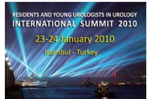
Figure 4: Invitation to international summit of Turkiye ESRU